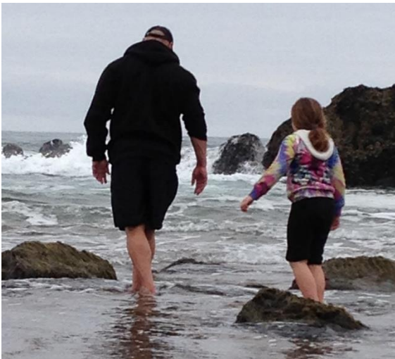
< Exploring with his daughter on the Oregon Coast

Is there anything else special about you that you would like to share?