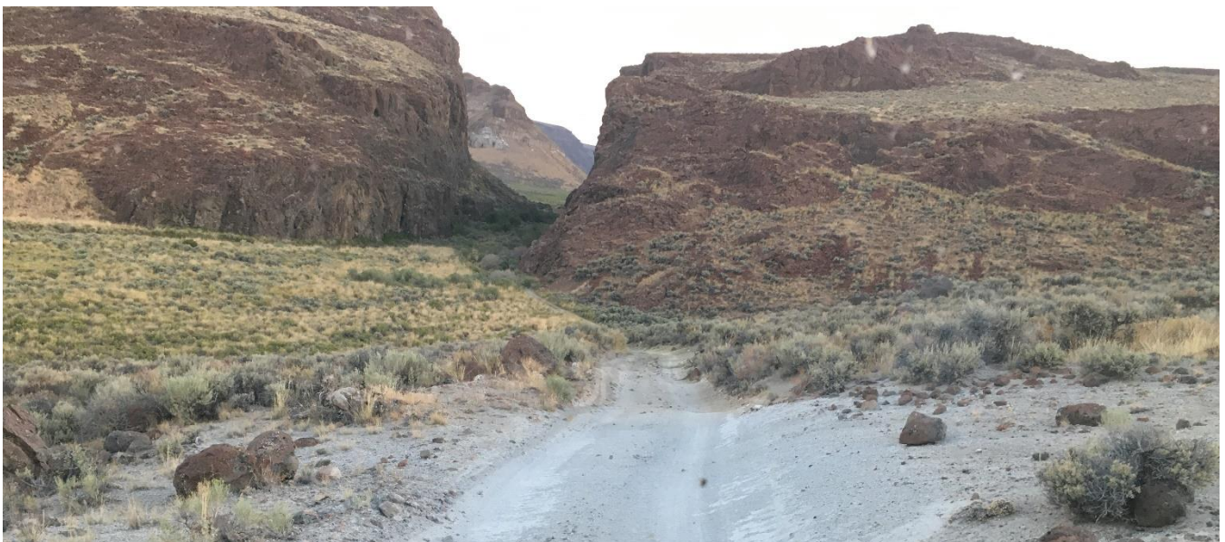
v Road Trip to Nevada