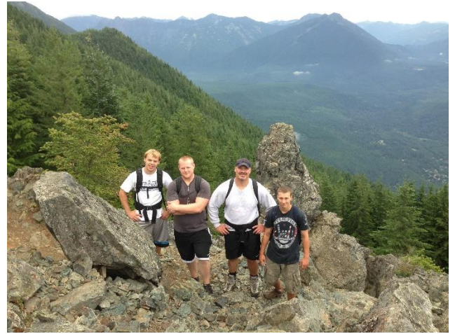
^ Hiking on Mt Si with former students

Read, keep fit, adult league sports, spend time with my daughter and wife, travel (road trips).